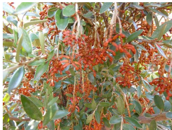
Grevillea diminuta , Small Royal Grevillea is found locally in Brindabella Ranges