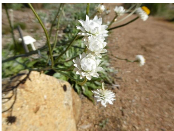
Ammobium alatum , Winged Everlasting. A species that can be considered weedy.