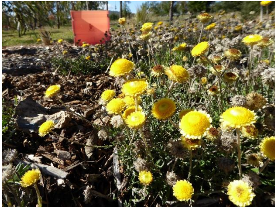
Coronidium gunnianum , Pale Everlasting. A hardy long flowering daisy