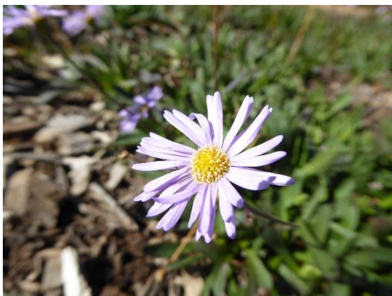
Brachyscome spathulata , Spoon-leaved Daisy A tufted perennial daisy species of National Parks.