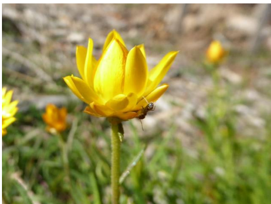
Xerochrysum viscosum , Sticky Everlasting A hardy perennial local daisy