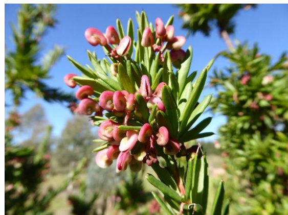
Grevillea iaspicula , Wee Jasper Grevillea. An endangered shrub first named in 1986