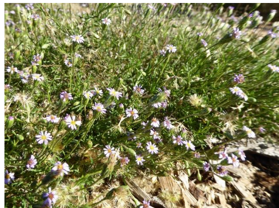
Vittadinia muelleri , New Holland Daisy. A low growing local perennial Daisy

Our working bees are held each Thursday morning from 8am, please feel free to join our friendly group at whatever time you can. We break for morning tea at 10 am at the table near our shed. An excellent (though please consider bringing something) morning tea is guaranteed.