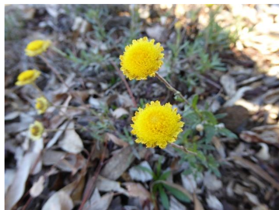
Coronidium scorpioides , Button Everlasting. A local perennial daisy species seen frequently.