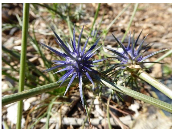
Eryngium ovinum , Blue Devil A perennial herb of the Apiaceae family as is the Flannel Flower