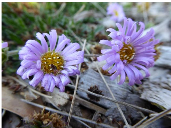
Calotis glandulosa , Mauve Burr-daisy. A perennial daisy with spiny seed heads.

A celebration of Daises as well as some other species.