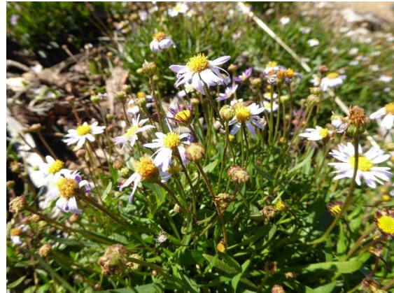
Brachyscome graminea , Grass Daisy. This perennial species tolerates moist conditions.